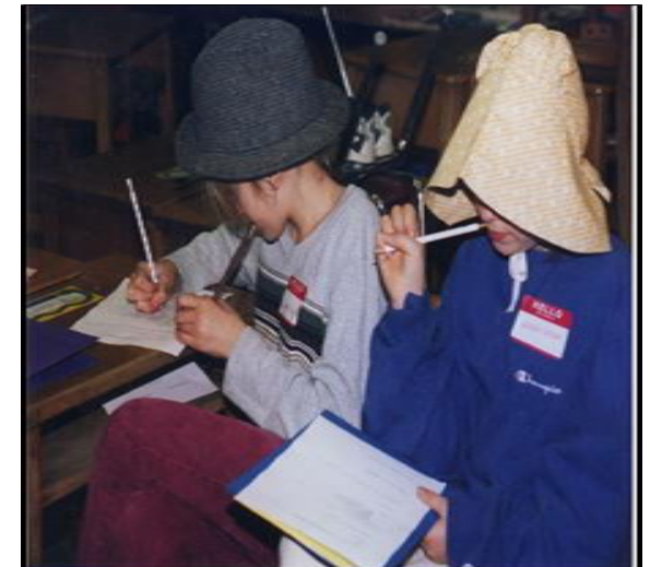
Role playing kids absorbed in character creation!

Ask the students to close their eyes and imagine the craziest creature they can dream up. Maybe it has only one leg, hops over tall buildings, and smells like bubble gum. Students are to write a description of this animal giving as much detail as possible. What does it look like? Where does it live? What sounds does it make? What foods does it eat? Is it fierce or friendly? Then have them write make-believe stories about their pretend creatures.